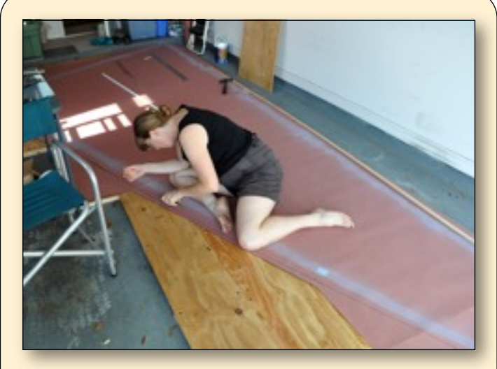
Meps helps with lofting which was done panel by panel in a small garage

The sails were sewn out of Odyssey III. All panels are white, except for the second from the top of each sail, which is red. There's a red polyester webbing boltrope around each sail. Ribbon telltales are sewn to the trailing edge of each panel. Each of the five jiblets has a telltale in the