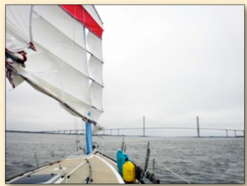
Flutterby, sailing in the Brunswick River beneath the Sydney Lanier Bridge