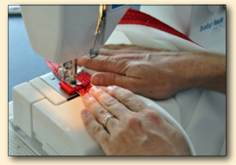
Much of the sewing was done using a heavy duty BabyLock machine which handled Odyssey III with no problems. Over two layers of polyester, webbing bolt-rope presented a challenge, and eventually forced Barry to borrow a sailmaker's walking foot machine.

middle on both sides. Depending on light conditions, the white fabric is transparent enough to read the leeward telltale, as well as the windward one.