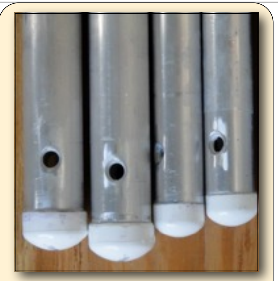
The ends of some of the mizzen battens, with PVC ends and caps epoxied in to keep the water out and protect whatever they are bouncing onto.

I have a running yard-hauling parrel on each sail. I have a fixed tack parrel. I rigged a standing throat parrel; I wanted to rig a running throat or luff hauling parrel but didn't have any clutches or cleats to attach one to. I used Slieve's spanned downhaul-parrel combination on both sails, but because I had an extra batten in the mizzen, I have a standing boom downhaul on the mizzen. It's basically a fixed line that limits how far up you can pull the boom.